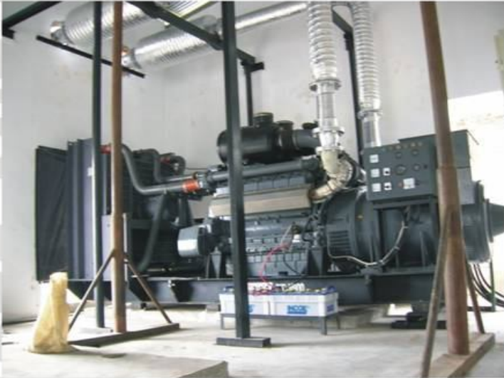
Engine Installed On Site

Triana Bintang has developed a data base in order to support a fast and act to solve problems spirit. ENERGY PAC is the system which all service team uses to check engine history for all customers who are taking our maintenance program. ENERGY PAC also gives fast spare parts available and report as detailed as possible during repairing and what has been done before and after.