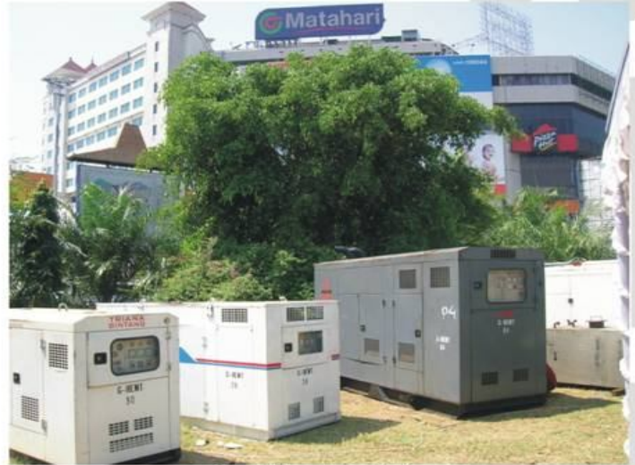
Short Event Rental