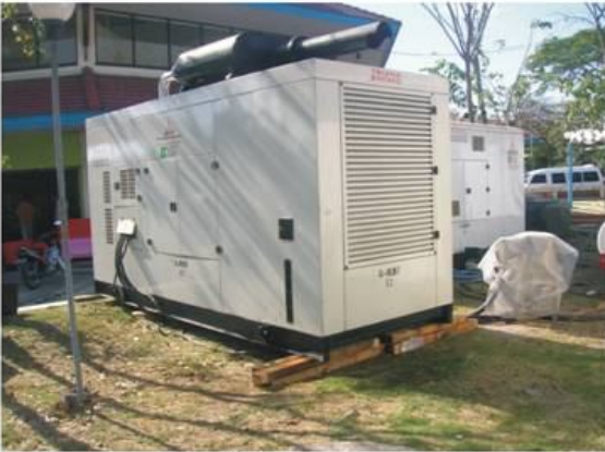
Exhibition Power Rental

Rental generation is created to maximize our service scopes. Our engine is ready to rapidly deploy to any locations to meet customer demands. The equipment we offer are diesel generating set, load bank, gas engine (future) and centrifugal pump.