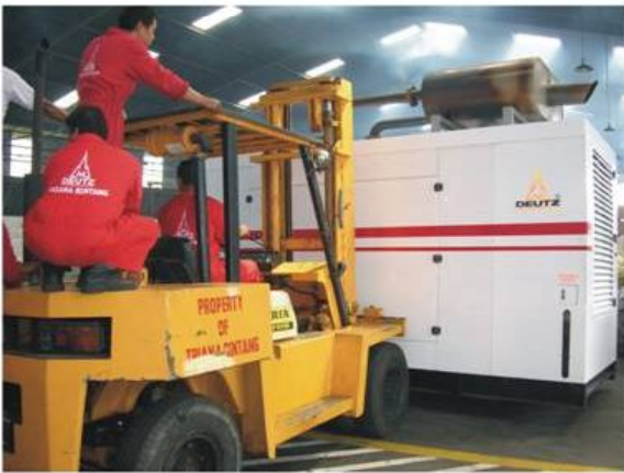
Delivering in one package