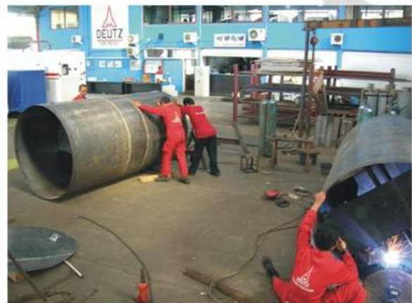
Diesel fuel tank manufacturing