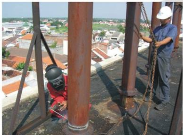
Installation in progress