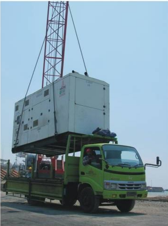
Rental In Bridge Construction