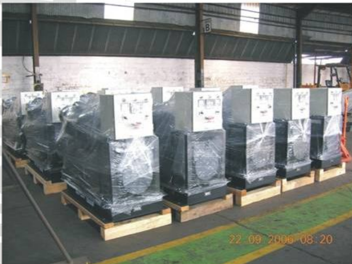
Manufacture - Testing - Packing