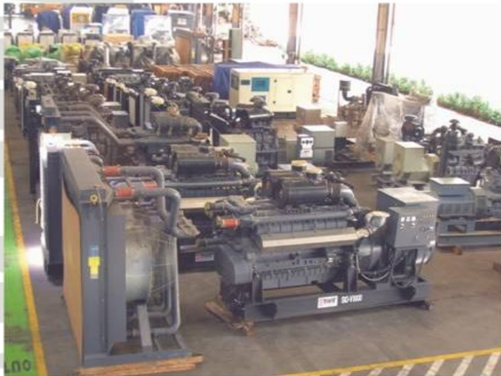
Ready to be Delivered Order