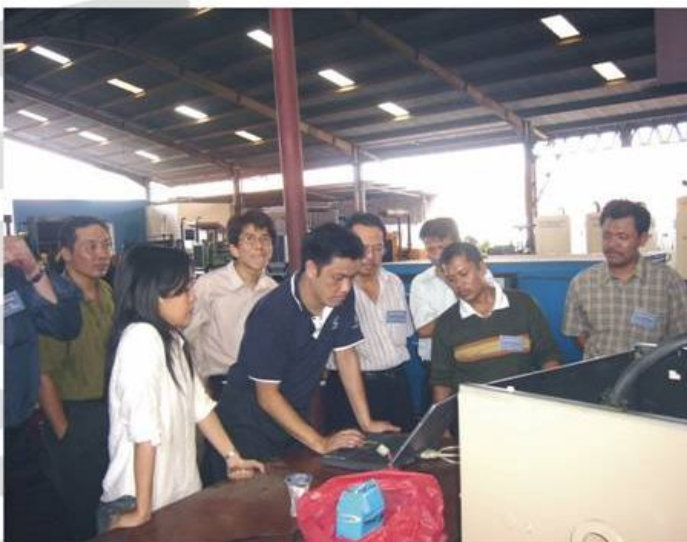
New Products Training Program