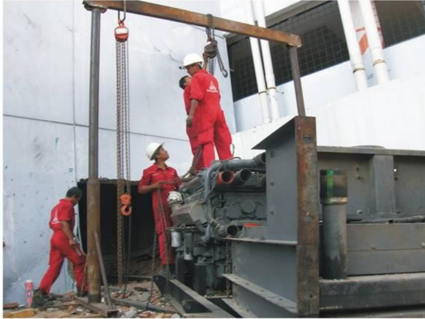
Genset relocating service

We offers various kind of services from engine sales, regular maintenance until total engineering. We also make sound proof genset, relocating genset, installations, and turn key solutions. We couple our products using Deutz engine applicable for genset, mobile machinery, pump set, compressor, marine etc. We manufacture our own daily tank, mother tank and silencer.