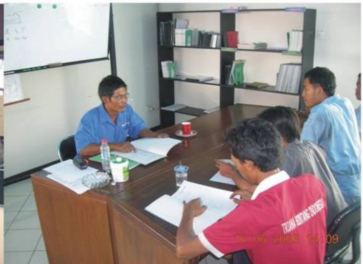
Internal Training Program