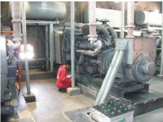
Total turn key solutions